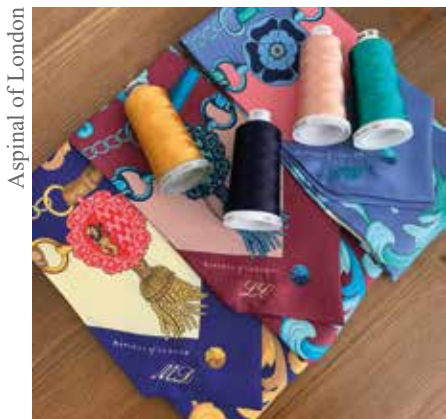
Aspinal of London