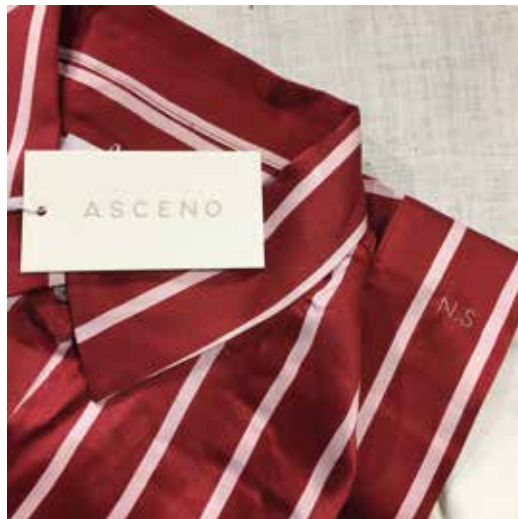
Hand & Lock / Asceno